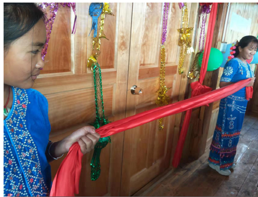
Opening day. Ribbon cutting ceremony.