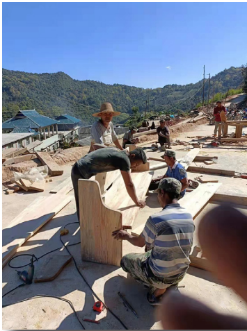
Constructing the wooden pews. It takes inspiration and perspiration.