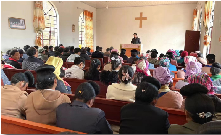
At this wonderful Christian elderly home, the residents are blessed with Sunday services and Bible studies every week. Visiting pastors often come to share an inspiring message.

East Gates has always had a heart for China's rapidly growing older population. Early on in the ministry, we helped subsidize the building of what is now one of China's most highly-rated Christian nursing homes. The founder is a pastor and our close friend of many years. His vision was to see China's neglected and rapidly growing elderly population be "loved to life" and to help them transition to their "new address." It's a great blessing to see what God has sown, bear so much fruit.