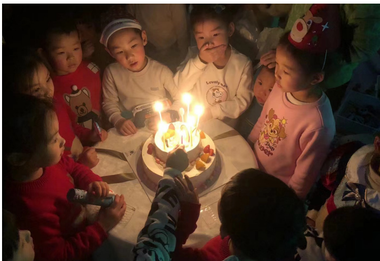
Chinese children light a birthday cake in honor of Jesus.

The lights that come with Christmas celebration brightened the “darkness” of 2021 filled with COVID deaths, massive floods, a swine flu epidemic and starvation.