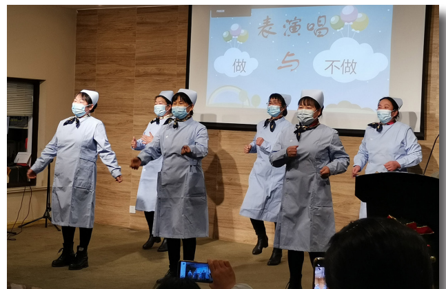
The Christian Elderly Home staff do more than just measure vitals and care for the resident's medical needs. They enjoy serving in many different capacities.

In the past decade, East Gates has not been able to safely assist as much in venues such as this because China's State Administration for Religious Affairs (SARA) continues to place more stringent measures on how foreign ministries can help wonderful projects like the above. In fact, at the beginning of this year, new SARA laws now state that all religious information posted on China's internet must be registered and approved by their proper department(s); otherwise, they cannot publish anything religious on the world-wide web. Please keep this issue in your prayers.