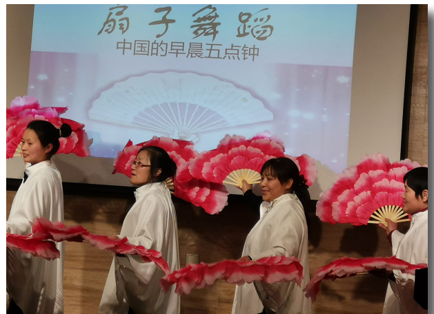
Every festival usually centers around a beautiful dance. Chinese New Year represents a time when one leaves winter behind and welcomes in spring which brings new hope and renewal.