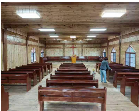
If you build it in harmony, He will come!

We look forward to the day when we can share a meal together with all those who have prayed for us and that we've blessed. It will be when Jesus returns at the wedding supper!