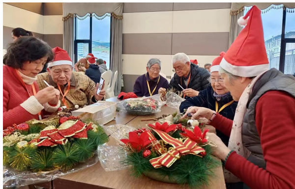
At an elderly home, the residents enjoyed one another’s company in making Christmas wreaths.