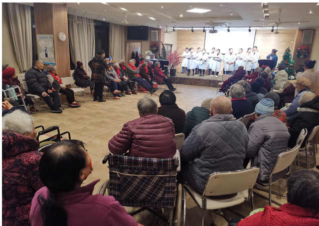
The residents enjoy watching the facility's Chinese New Year celebration program.