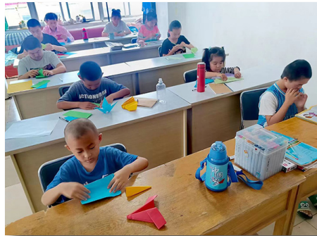
Meanwhile back home, volunteers cared for the youth to ensure their daily pattern and rhythm of life stayed the same.