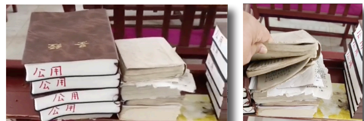
East Gates provided cases of Bibles like those on the left to replace the heavily used on the right. One could say it's a good problem.

Sometimes pastors will send us requests for Bible replacements because after years of church use, they need a new supply. In America, we can just place a small or large order via Amazon and it's at our doorstep in a few days. Not in China. That is why many depend on East Gates to provide and deliver.