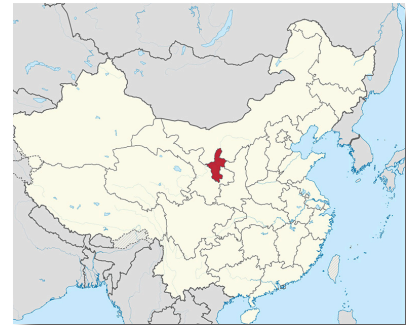
Ningxia Hui Autonomous Region