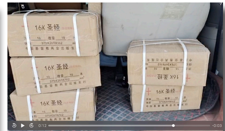
In Shandong Province, we gifted these large print Bibles to the elderly who did not have the funds to purchase them. Out of kindness and gratitude, most Christians who order Bibles from us always let us know when they have received them in good order via a photo or as in the case above, a short video.

Sometimes pastors will send us requests for Bible replacements because after years of church use, they need a new supply. In America, we can just place a small or large order via Amazon and it's at our doorstep in a few days. Not in China. That is why many depend on East Gates to provide and deliver.