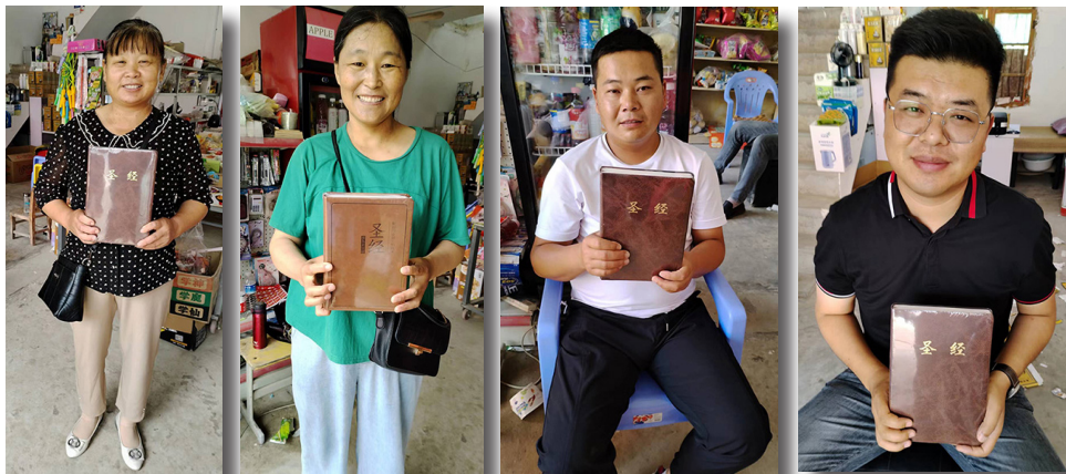
Christians from a registered and official church in Anhui province tried ordering Bibles without success. They contacted us and during the first week of July sent photos thanking us for the Bibles they received.

At present, our China and Hong Kong staff have not seen this re-written Bible for distribution through the registered channels. Their thoughts are, "We're just grateful for the window we've had in the past three decades to legally distribute the millions of Bibles we have, and are still able to provide, while the harvest is ripe. We know there's coming a time when there will be as the prophet Amos wrote, '...a famine...of hearing the words of the Lord' (Amos 8:11). That time may be sooner than we think either in the form of the government's re-written Bible replacing the RCUV, ESV and other similar versions or greater persecution. In the meantime, we provide the 'five loaves and two fishes' and let God take care of the multiplication."