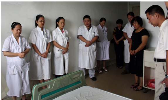
This praying medical staff knows who our Great Physician is and whom they need to go to for wisdom to help restore the poor in spirit and sick.

Sometimes it takes years to perfect one verse out of our training manual, the Bible, but like an Olympic athlete who practices every day, so do we. For example, to live by Ephesians 4:29 (Amplified) is a major challenge for most spiritual Olympians -- "Let no foul or polluting language, or worthless talk [ever] come out of your mouth; but only such [speech] as is good and beneficial to the spiritual progress of others, as is fitting to the need and the occasion, that it may be a blessing and give grace (God's favor) to those who hear it." Can you imagine if everyone in the world lived by this verse? That is what we share with our Chinese students. It can start with you. You can reveal what the true rewards are that come from the true training instruction Book, the true Coach and the true Spirit by what you pray and live out each day.