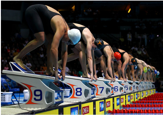
The start is sometimes the most important part of the race. The body and mind are at full attention -- listening and intensely focused.

In our training sessions, we speak of the things that are not yet, as if they are. We don't train for Kingdom glory because we have to but because we love the King and we want to. Every morning, we rise with the Son and meditate upon His ways like an athlete rehearses for the perfect dive, run, jump or swim. We absorb His truths so in time it becomes instinctive and a life-giving habit versus just a technique.