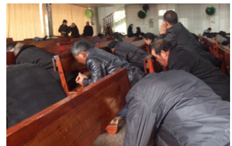
Chinese "Olympians" know that Godly perseverance comes with collective prayer during times of church persecution as what recently occurred in Wenzhou, China.