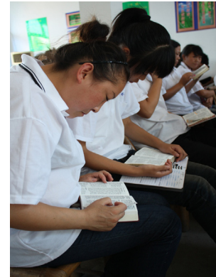
Students preparing for the life to come at the Cixi Training School.

Sometimes it takes years to perfect one verse out of our training manual, the Bible, but like an Olympic athlete who practices every day, so do we. For example, to live by Ephesians 4:29 (Amplified) is a major challenge for most spiritual Olympians -- "Let no foul or polluting language, or worthless talk [ever] come out of your mouth; but only such [speech] as is good and beneficial to the spiritual progress of others, as is fitting to the need and the occasion, that it may be a blessing and give grace (God's favor) to those who hear it." Can you imagine if everyone in the world lived by this verse? That is what we share with our Chinese students. It can start with you. You can reveal what the true rewards are that come from the true training instruction Book, the true Coach and the true Spirit by what you pray and live out each day.