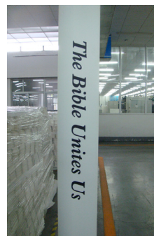
Painted on a column at Amity Printing Press.