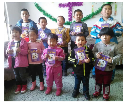
East Gates gifting the youth with children's Bibles.