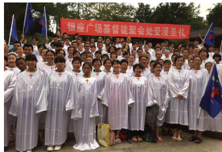
Rejoicing in the fruits of one's labors with the baptisms of our Jiangxi Province brothers and sisters.