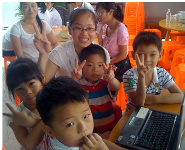
East Gates helping young believers stay on fire and not lose sight of their goal and imperishable crown.