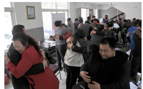
Supporting Marriage Enrichment Retreats to equip couples to build Godly families.