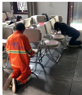
A streetworker and others take time to pray during their busy day.