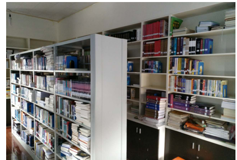
We contribute Christian resources to their seminary library.

Your loving and faithful partnership allows us to help our Chinese brothers and sisters prepare for their marriage to the Lamb! Let us not be distracted. "Grace and peace be multiplied to you in the knowledge of God and of Jesus our Lord; seeing that His divine power has granted to us everything pertaining to life and godliness, through the true knowledge of Him who called us by His own glory and excellence" (II Peter 1:2-3).