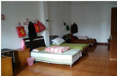
The elderly love their new home where they feel safe and secure.