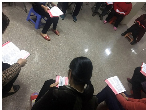
Mai-yuan church Bible Study