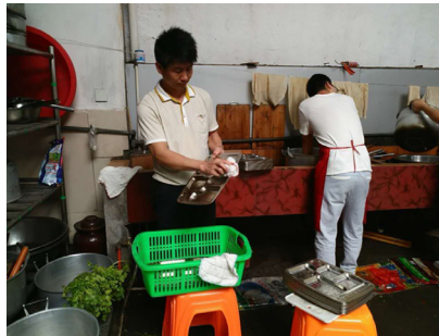
There's never a shortage of volunteers.