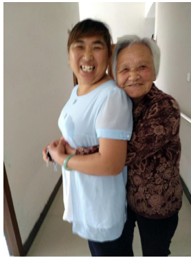
Thankful for all things.