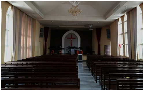
House church sanctuary.

Just recently, we met with a large group of House church brothers and sisters that have a good relationship with the local authorities. There was a time when the congregants were spiritually malnourished due to poor leadership but with new "shepherds" that have come in, the church is now thriving. They even started and support a wonderful Elderly Home.