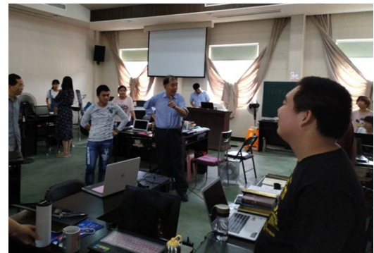
Meeting with pastors and students in their training rooms.