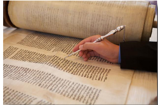
A Hebrew scholar reading the Torah Scroll.

And the Word became flesh, and dwelt among us, and we saw His glory, glory as of the only begotten from the Father, full of grace and truth. John 1:14