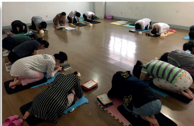
Early morning prayer and worship time at a training center where we were asked to teach. Two places were reserved for us near the back wall.