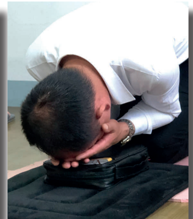
Chinese students and church workers take prayer time seriously.

We knew Prayer Portions would open their eyes to a whole new way of praying effectively using scripture and help them hear God better. It covers all the titles and attributes of God which describe His nature. By speaking forth His names, one’s soul can only be encouraged. Since most of the students are also full or part-time church co-workers, we knew that topics in the book such as: Praise on Earth like in Heaven , Keys to Breaking Bondages , Praying on the Armor of God , Exposing a Religious Spirit , Who You are in Christ , Praying for Spiritual Leaders , Is My Heart God’s Resting Place and Prayer that Hits the Mark would inspire them as well.