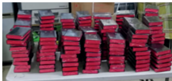
Bibles we sent to the "Shepherd districts." Small portion shown here.