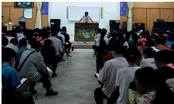
East Gates equips a large Bible study in Yunnan province. Please pray for our limited resources at this time. As more churches knock on our door with greater needs, we’d like to say “yes” to them more than “no.”

I n this season, we celebrate Yeshua (Jesus) who is the Light that grows increasingly brighter through our Chinese brothers and sisters and you. Let us help each other keep our lamps trimmed and burning (Matthew 25:1-13) in preparation for our soon-coming King!