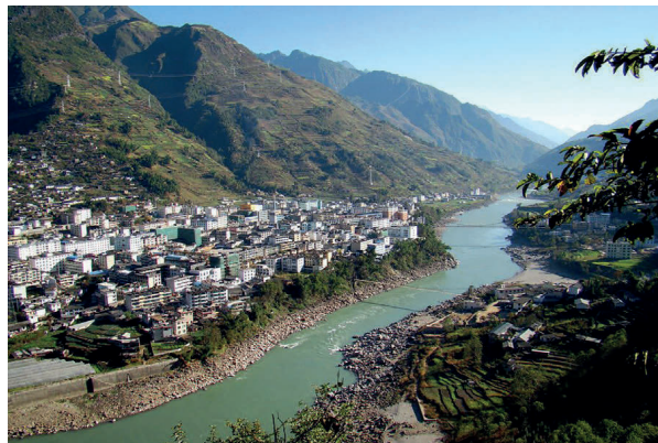
Many of the areas in China where East Gates serves, like Yunnan province, has a natural beauty and spiritual message that gives even greater meaning to scripture (Proverbs 21:1).

F or the continual Godly perspective and wisdom you give our East Gates staff and the divine harmony in which we all work together. When we asked our China Project Director what he felt 2019 would bring for the believers and churches in China? His answer was: “My point of view is clear. There will be a lot of difficulties but a promising future. It’s like the Mississippi River that originates from the Rocky Mountains yet finally flows into the Gulf of Mexico. Mountains can never block the waters that ultimately flow into rivers and into the sea!”