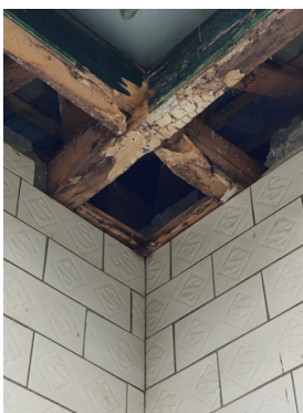
Rotted wood beams exposed throughout the church structure reveal major safety hazards.