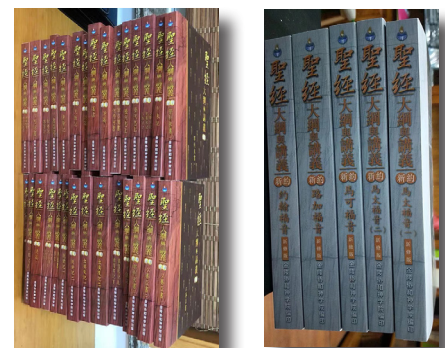
Bible - Outline and Lecture Series reference books. Old Testament series (L) and New Testament - 4 Gospels (R).