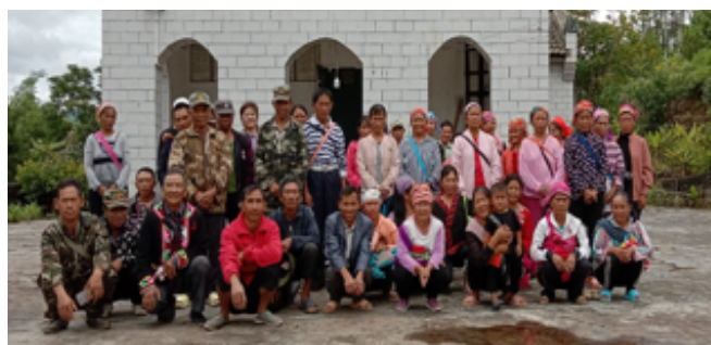
Church members never missed a service until they were told it was unsafe to meet inside. Congregational unity and harmony come with a loving pastor and allowing God’s Spirit to work with His Word in transforming lives.

EAST GATES WILL BLESS THE HABO MA XINZHAI CHRISTIAN CHURCH WITH RMB30,000 ($4,475) TOWARDS THEIR NEW CHURCH BUILDING PROJECT.