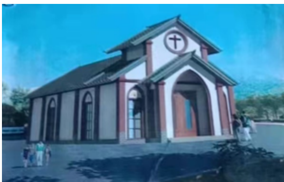
Architectural rendering of what they hope will be their new church building. Thankfully, the new design is not open to the elements like the old church.

Our old church was built on April 25, 2005. Due to insufficient funding and cheap labor at the time, the original structure was not constructed well. Over the years, the foundation, pillars, walls and roof have deteriorated to where it is not safe to meet there anymore. As a result, church members have stopped attending regular worship services. We formed a church building committee and decided to demolish the old church and rebuild a new one. We have a dream that the new church design will reflect our ethnicity and national culture. We live in a high mountainous area where transportation services are inconvenient and the local economy is poor. Our building committee has counted the cost and it will require RMB420,000 ($62,654) to build our new church. Over the past 10 years, we’ve only been able to collect RMB270,000 ($40,300). This is a big gap. We hope pastors, brothers and sisters in the Lord will pray for us and hopefully provide some assistance. May God remember your labors! Emmanuel! ~ Pastor “L”