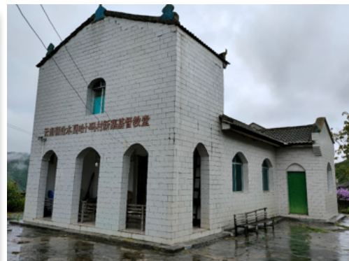
Their present church is unsafe to enter due to structural deterioration of foundation, pillars, wood beams and rafters.

EAST GATES WILL BLESS THE HABO MA XINZHAI CHRISTIAN CHURCH WITH RMB30,000 ($4,475) TOWARDS THEIR NEW CHURCH BUILDING PROJECT.