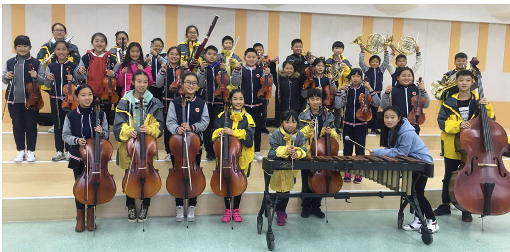
Creating an orchestra from village youth who never had instruments or knew how to read music was a miracle but the latent talent that came forth was amazing. We'd say they are ready to go on tour!