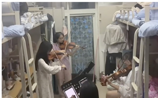
During the recent Covid-19 lockdown, students continued to practice in their dormitories. We wish you could hear the actual video recording. The three violinists and a cellist harmonized so beautifully together playing Amazing Grace .