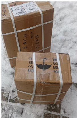
Delivering the Sign Language Church Bibles.

“ P ace dear brothers and sisters in Christ, Today, we received the Bibles you mailed to us. Thank you so much. May the Lord remember your silent support for us. May the Lord encourage us to use the Bible to help the members of the church better understand the preciousness of the Lord’s words and truly root us in the Bible. We pray that this foundation will make us like the Apostle Paul, who was specially sent to preach the Lord’s gospel, dedicated to service and faithful to the mission. Sincerely ~ the Sign Language Church ”