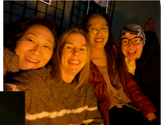
Prayer warriors interceding early in the morning.