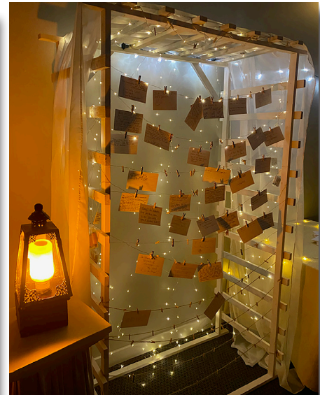
Prayers of praise and thanksgiving.

A s we enter 2025, our admonition to our Chinese brothers and sisters is ~ May we spend more time around God's Throne Room, listening to HIS Voice versus all the voices of this world. May we spend more time in God's revelatory Word, versus all the social media. "For when the Son of Man comes, will He find faith on the earth? (Luke 18:8)." We pray so. Thank you for your invaluable contributions and life-giving prayers.