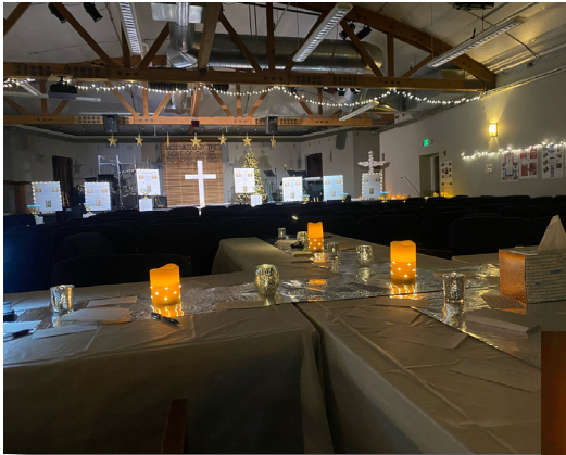
Main sanctuary displaying God's Kingdom work around the world (one of which is East Gates) and other major prayer needs.

On New Year's Eve, a number of local churches held their annual prayer vigil for East Gates and other influential ministries. It was so inspiring and encouraging to see how these sisters and brothers prepared a sacred space to invite God's presence, anointing and revelation to bless East Gates and other Kingdom work.