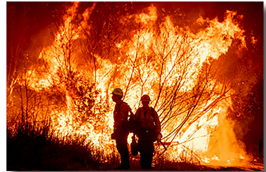
Firefighters battle 24/7 the flaming Southern California infernos.

We told our Chinese students, you cannot borrow another believer's Holy Spirit, faith or righteous deeds. God gives you His loving power and grace to walk in the image of God to fill your own vessels.