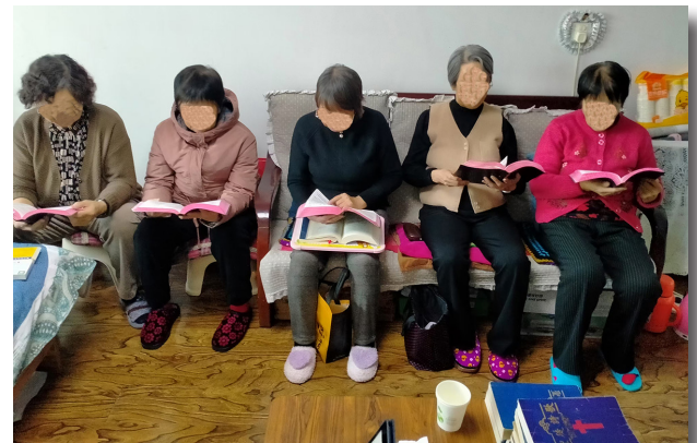
East Gates provides Bibles and discipleship training to the elderly Christians in Liaoning province.

Oftentimes when we are in the more remote villages of China where women carry the brunt of the church and family responsibilities because the men are out in the fields, they ask if God really sees their labor of love and works. We say, "Most definitely" and share with them the story about Dorcas or Tabitha in Acts 9:36-42. Here was a dear sister in the Lord, who like them, had a reputation for habitually providing loving acts of kindness and charity. Sadly, she got sick and died but because of how priceless she was to her community of faith, the local disciples sent for the Apostle Peter who was nearby. He knelt down beside Tabitha, prayed and said, "Tabitha arise!" She came back to life! The Chinese women were encouraged.