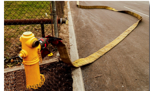
In key areas where the fires raged, shockingly, fire hydrants had no water pressure or water.