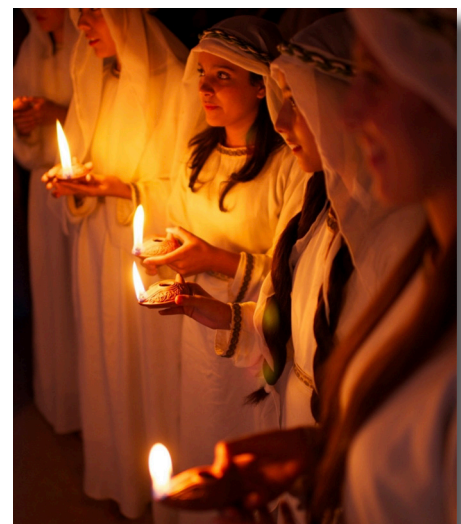
Five virgins were prepared to meet their Bridegroom. There is no greater feeling than being ready.